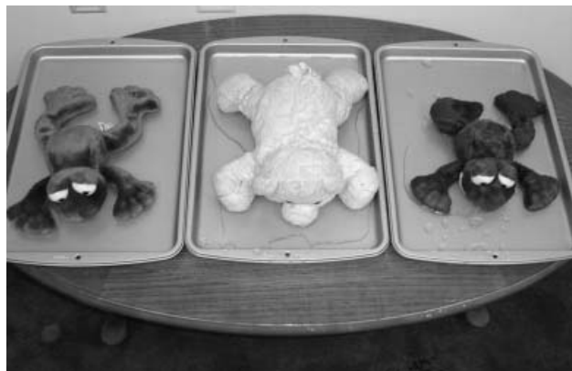
Fig. 1. The three test items for Study 1: dry nontarget (frog), wet distractor (pig), and wet target (frog).

Test Phase. The test phase was designed to see whether the children would identify the target animal as the one that had undergone the change they had heard about. Figure 1 depicts what they saw when entering the room: a small table with the three animals sitting on trays. Two of the animals—the target and the distractor—were wet, whereas the nontarget was dry. The distractor animal was wet to control for the possibility that a child might choose the wet target animal just because it was more interesting than a dry one. The wet distractor was always in the middle, with the wet target animal on the left for half the children and on the right for the others. The experimenter asked